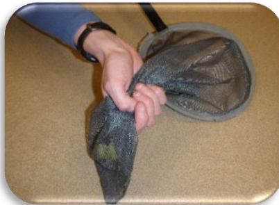
Step 2: pinch the net above the bird to prevent its escape