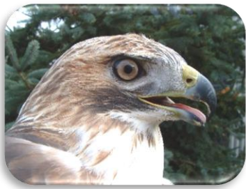
A Red-tailed Hawk