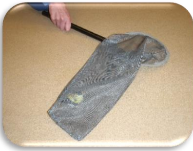
Step 1: place the net over the bird