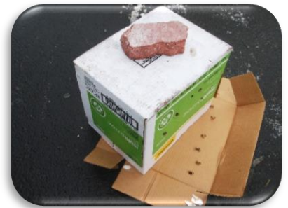
Cover the bird with the inverted box and slide cardboard under the box

The Wisconsin Humane Society is a charitable organization that depends entirely on donations to fulfill its mission to create a community that values animals and treats them with respect and kindness. Your support for the WHS Wildlife Rehabilitation center makes possible the distribution of information like this to thousands of people who request it each year and makes possible the humane care of over 5,000 injured, sick, and orphaned wild animals from our community each year. You may donate online or by mailing a check to the following address: WHS Wildlife Center, 4500 W. Wisconsin Avenue, Milwaukee, WI 53208