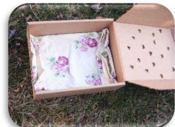
Box opened to show cloth lining