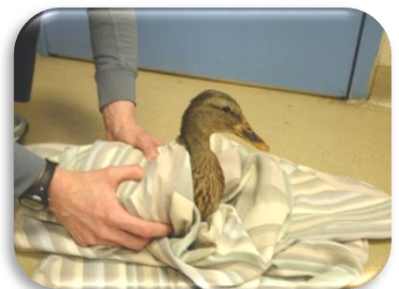
Here the sheet has been pulled back for illustrative purposes