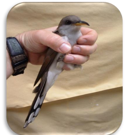
Demonstrating proper restraint of songbirds. Wear vinyl or nitrile exam gloves if available. Wash your hands after handling a bird.