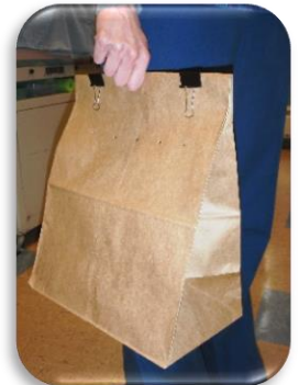
Paper bag clipped shut at the top

Note: Birds collide with windows because of the reflections on the glass. Reduce the risk of window collisions by applying Whispering Windows static window clings, WindowAlerts , or ColliEscape Bird Tape on the outside of problem windows. Each of these products is available through the Wisconsin Humane Society Online Store . For more information about preventing bird window collisions, visit our WIngs page .