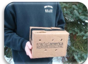
Box with air holes in side; top taped shut