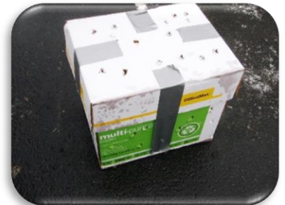
Tape the cardboard panel to the box to fully contain the bird for transport