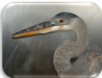
A Great Blue Heron