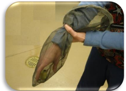
Step 3: reach in and gently grasp the bird